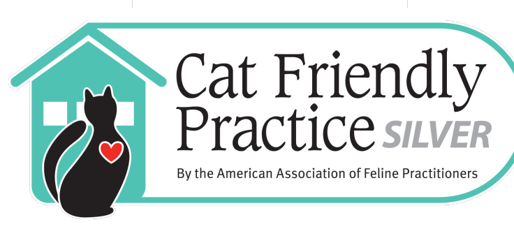
AAHA and Cat Friendly Logos