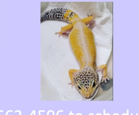
Example of what will be posted on social media and the website