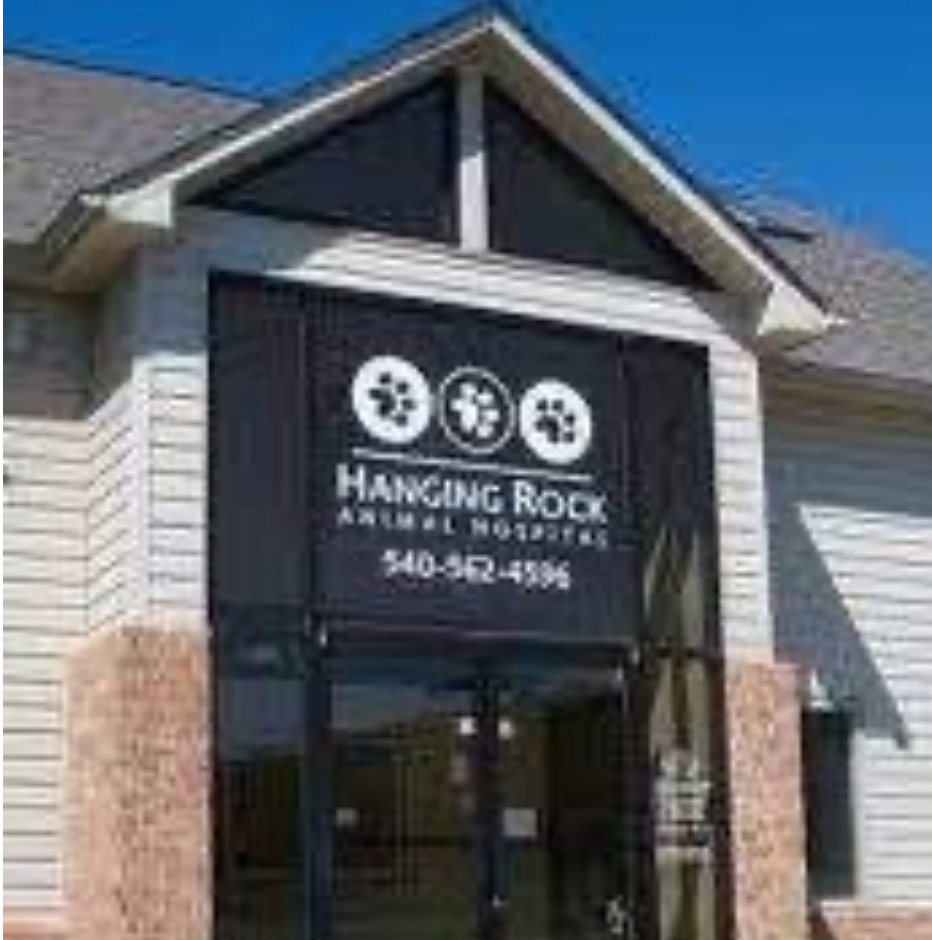
Hanging Rock Animal Hospital