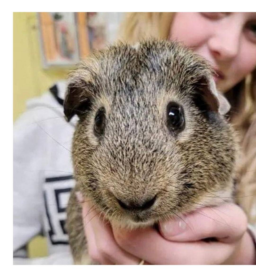
Some exotics seen at Hanging Rock Animal Hospital