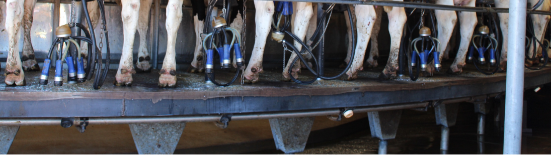
Cows in a dairy farm being milked by a 60-point rotary milking parlor