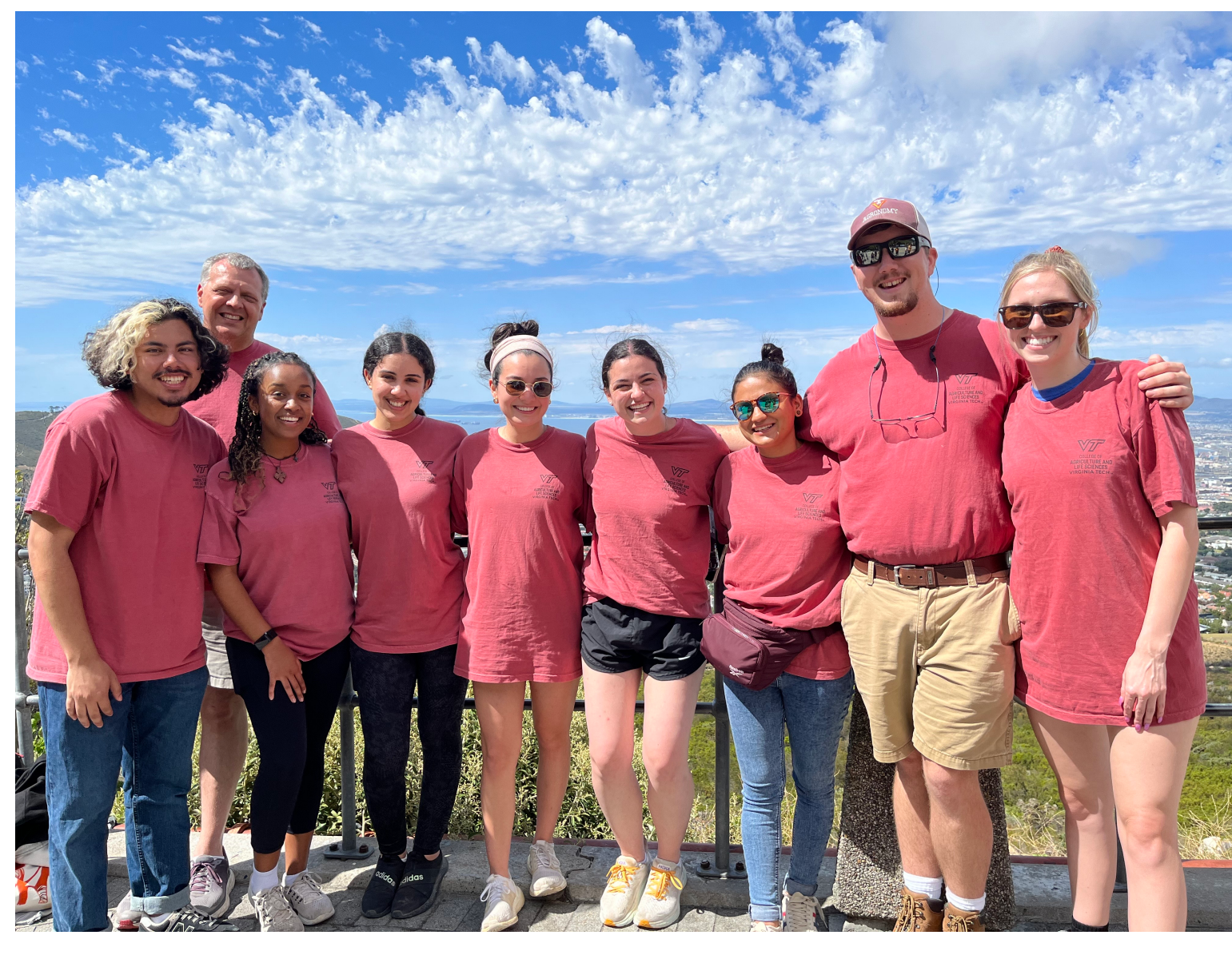
A group of us in Cape Town before we headed up Table Mountain on an aerial cableway

Farm and learn about trophy hunting. I got to stay in Kruger National Park and went on Safaris which led me to see some of the Big 5. Next, I was able to visit a diamond mine where the world's biggest diamond was found. For the remainder of my trip, I stayed at Stellenbosch University where I had the opportunity to listen to lectures, visit their Sustainability Institute, and visit places such as a winery, Robben Island, and Cape Town.