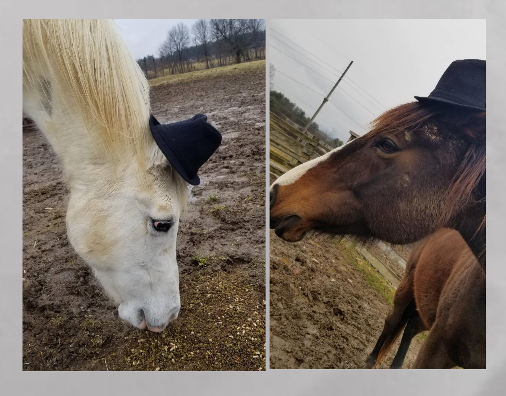
2 horses from the teaching herd, Apple( white) sara( brown)

How to install a French drain. The Home Depot. (n.d.). Retrieved April 6, 2023, from https://www.homedepot.com/c/ah/how-to-install-a-french-drain/9ba683603be9fa5395fab9012cc2665