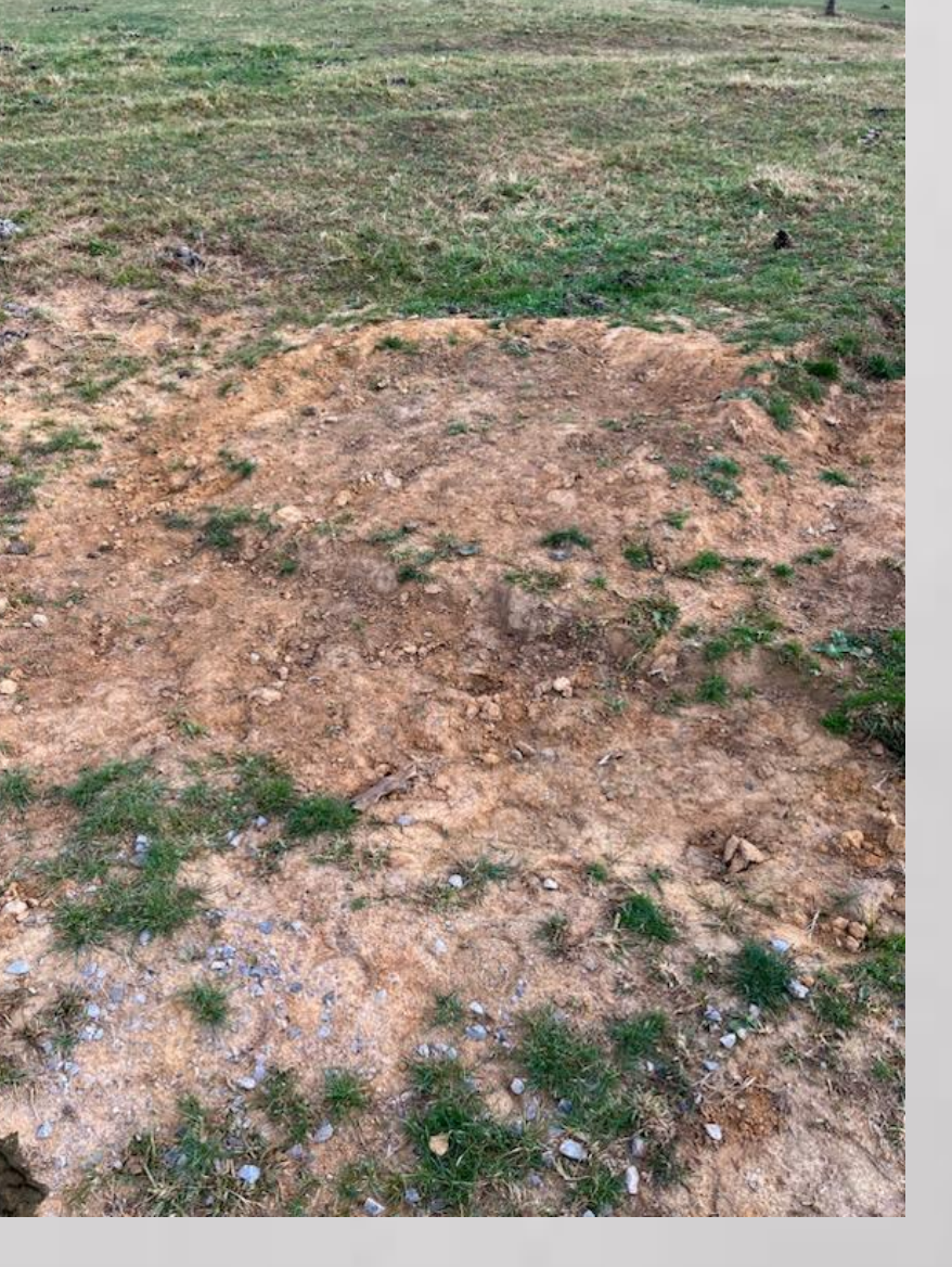
These two images show the installation site after 2 weeks of varied weather. The drain is concealed and the water drains away from the gate