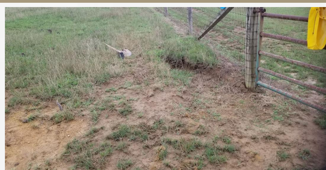
This is an image before the site was plotted, notice the puddle behind the gate.